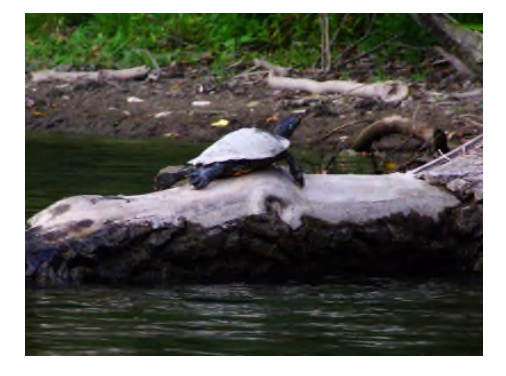
Page 6 of 6